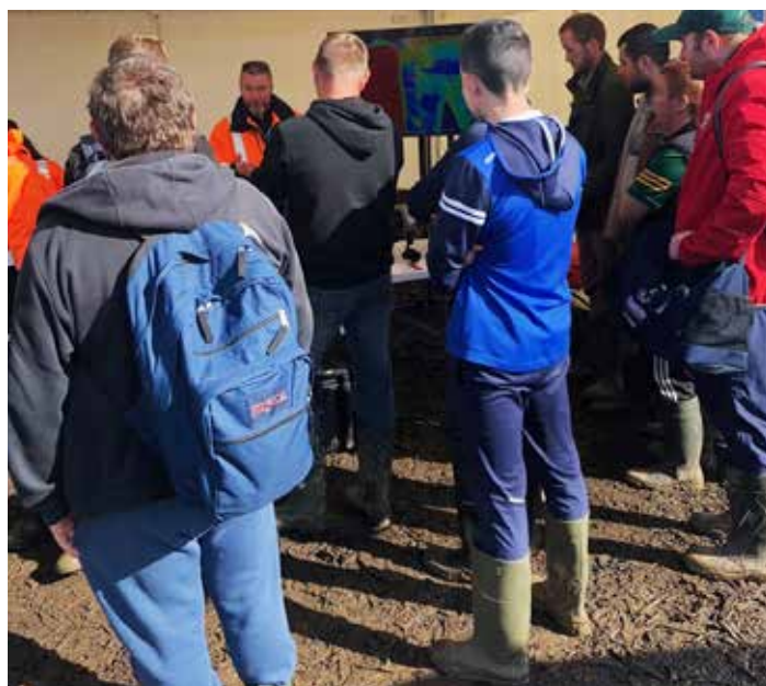
▲ Drones and sonar equipment demo on site