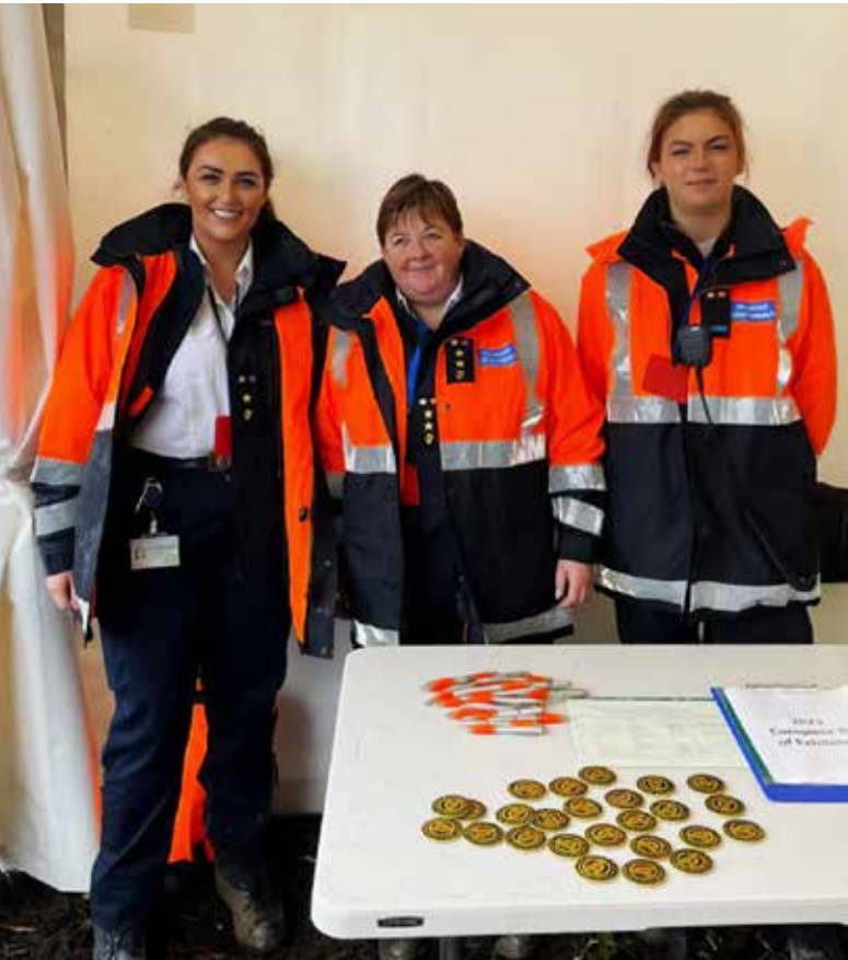
▲ Ploughing Championships, manning our info desk