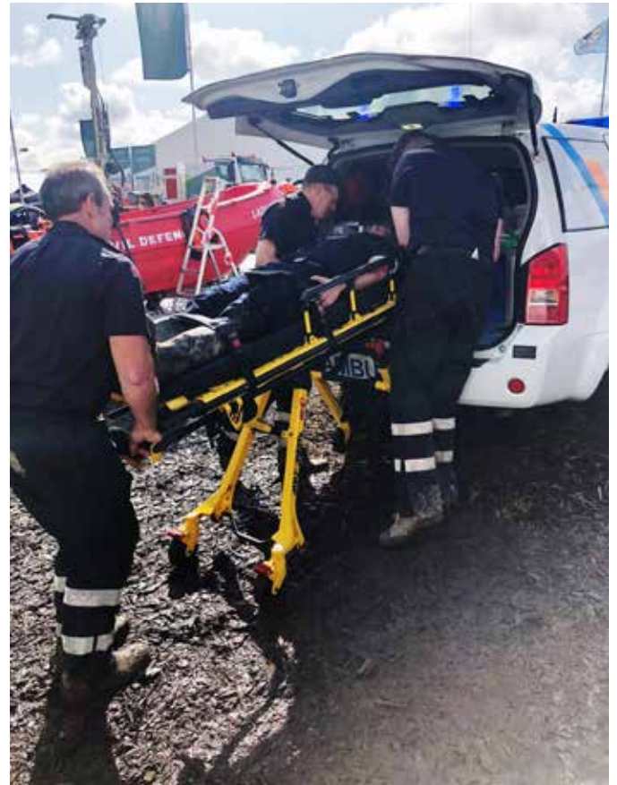
▲ 4WD Ambulance stretcher demo on site