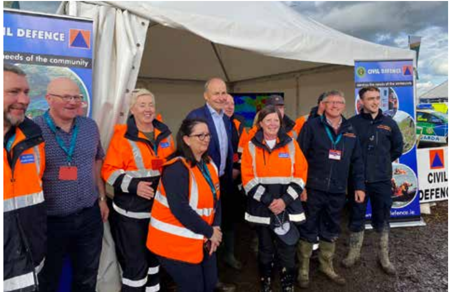
▲ Ploughing Championships, Minister for Defence, Micheál Martin visits Civil Defence site

CPR demos were provided daily to all-comers, drone and sonar demos were very well received, and we had a very healthy number of visitors to the All-terrain Vehicle, the 4WD Ambulance, the Whaly Boat and the Communications Vehicle.