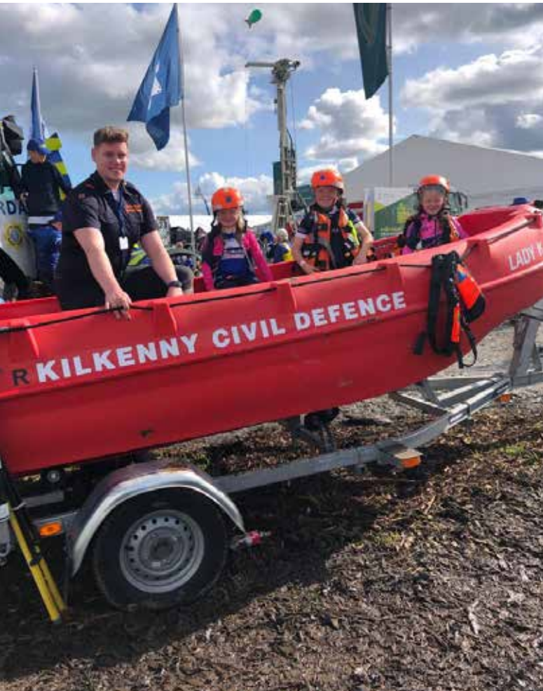
▼ Ploughing Championships, visitors to the Whaly Boat on site