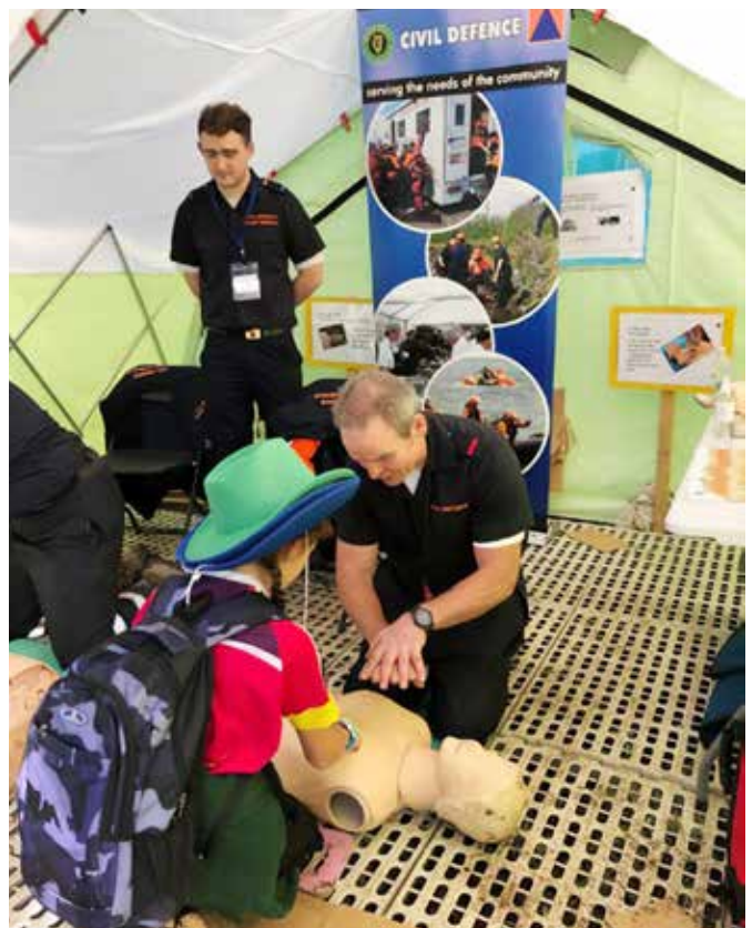
▲ Ploughing Championships, CPR demo on site