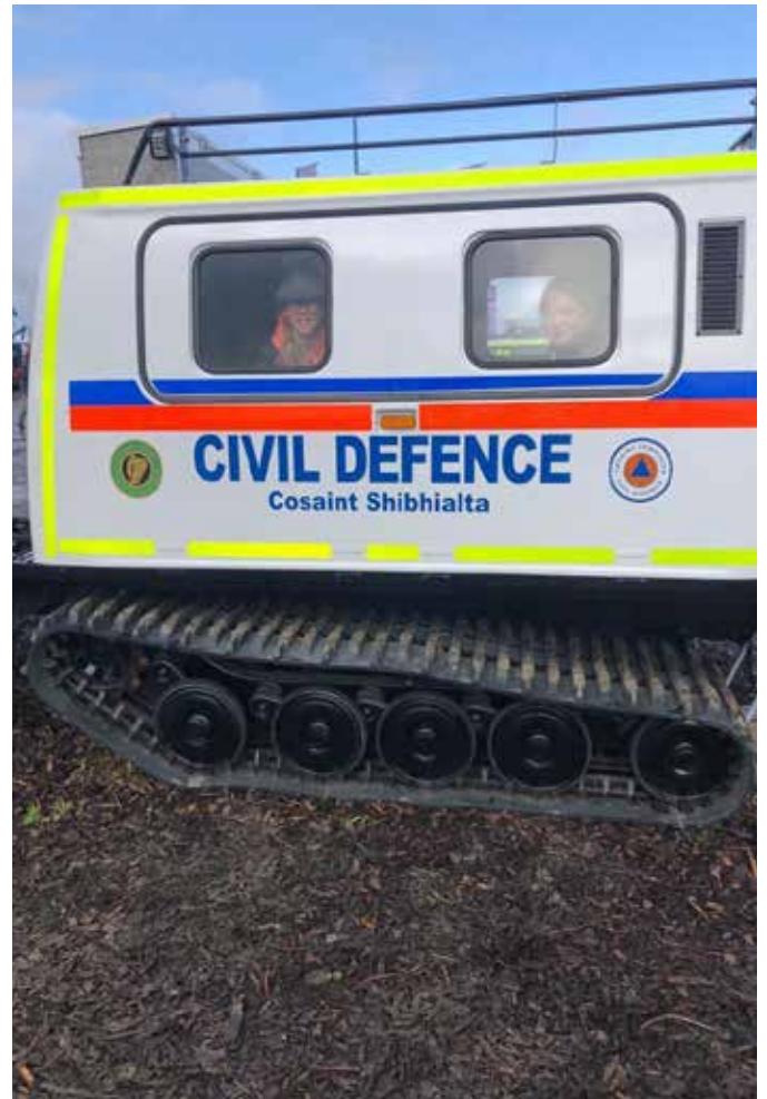
▼ Two young visitors to the All terrain Vehicle